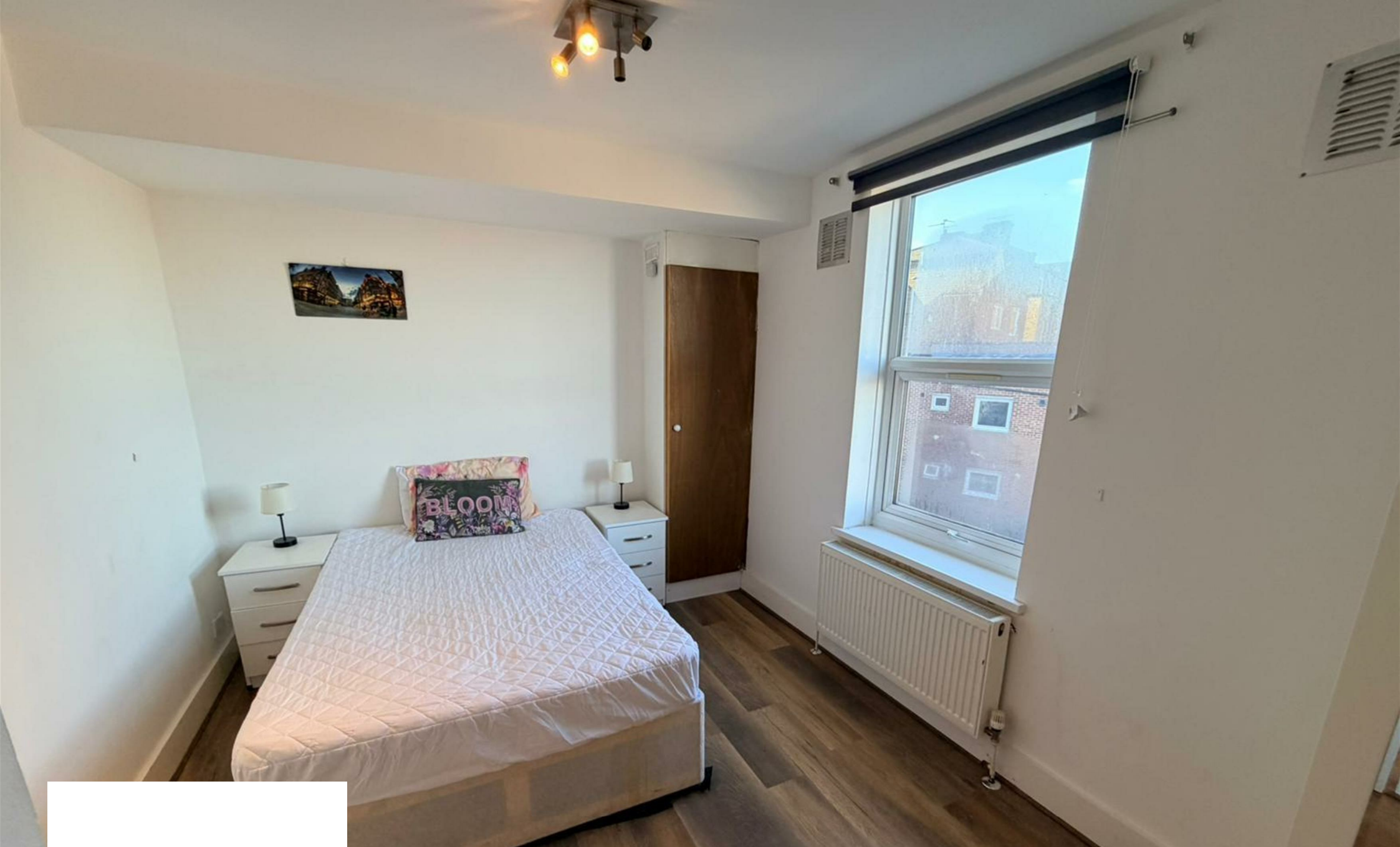
64 Crouch End Hill Hornsey, London, N8 8AG £1,050